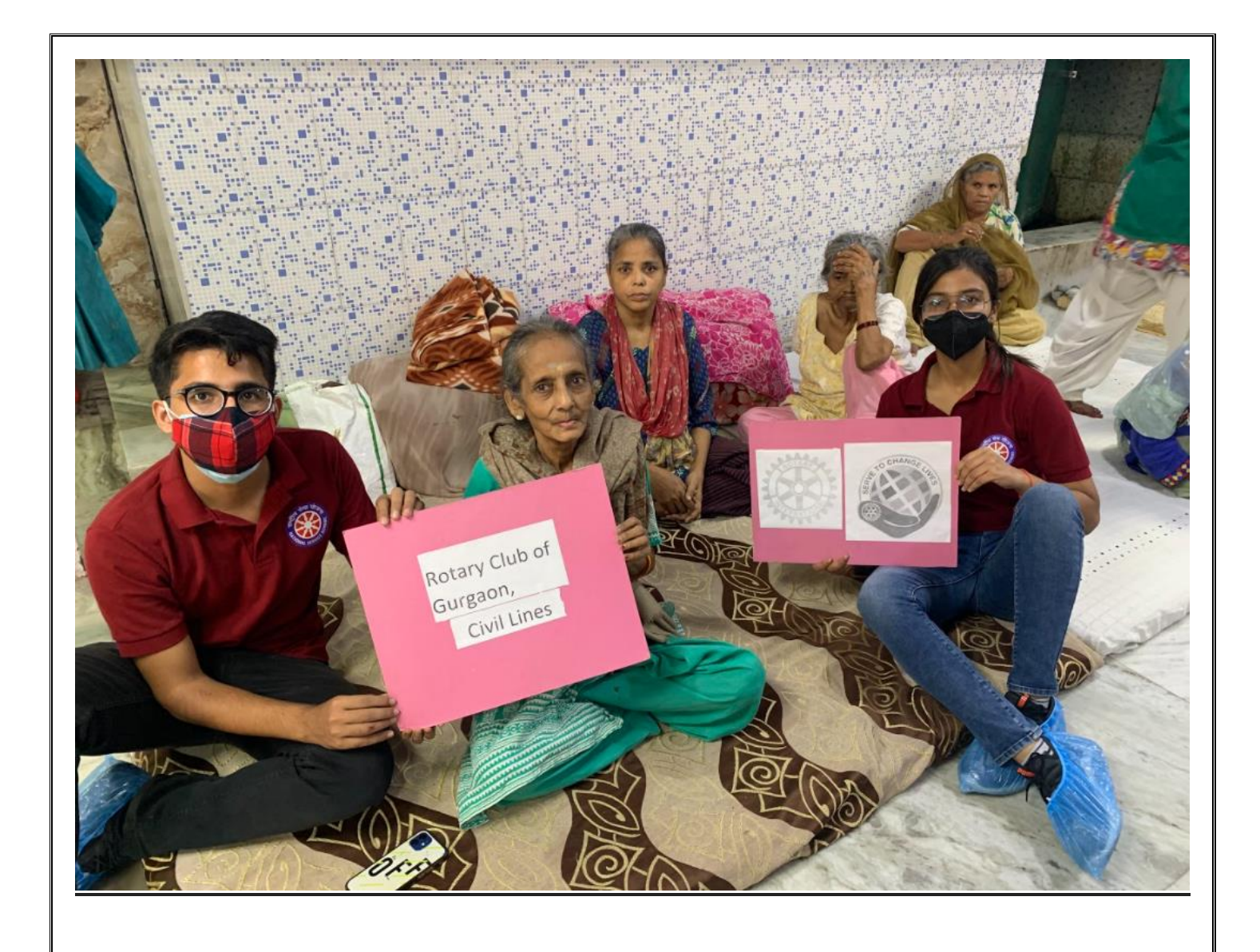
Our volunteers spent time with the people at the old age home